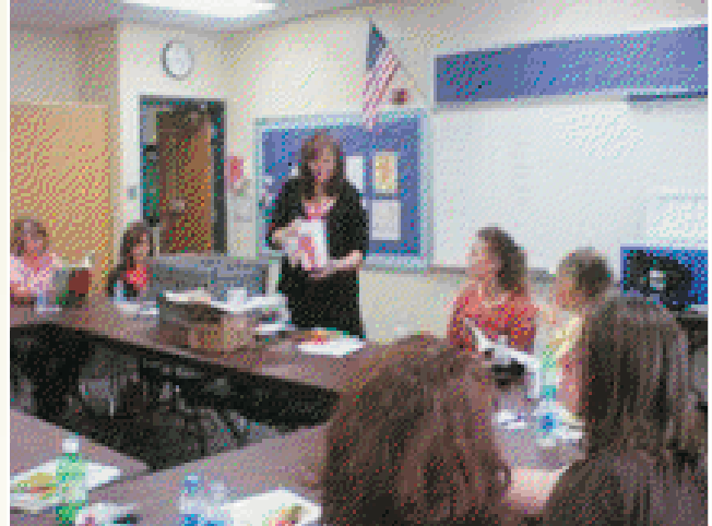
Teaching the Teachers! Whitley County pre-school teachers gathered for a training session in which they learned techniques to help little minds develop a big love for science.

Why, in Pre-school, of course! WhitleyForward has purchased science teaching kits for use with pre-school age children. All eight of the pre-schools in Whitley County will be introducing their little ones to the fascination of science at a level they can understand. Each kit provides a number of activities and lesson plans which will keep the students busy and interested over a number of weeks. In late September, 17 pre-school teachers received training for using the kits by the science professionals who developed them. So if you have a little one in pre-school, watch out—you may have a budding scientist on your hands. ♡