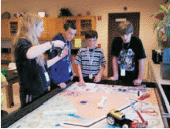
Members of the newly formed ISMS Robotics Team put their minds to work as they direct their robot through a series of missions.

When we hear that some Whitley County 8th grade students are learning about casting bones, screening blood, nerve mapping and installing pacemakers, we know that something great is happening!